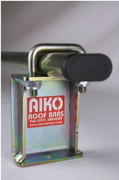
ZS U bolt fixing

You can probably see what's coming next- lay your bars across the tops of your brackets, make sure you are happy that they are evenly positioned left and right, drop your U or A-bolt over the top and do up the M8 Nyloc nuts. Stop tightening these just as the bars are nipped- if you bend up the corners of the bracket at all, you've gone way too far- so aim for no more than 10nm torque.