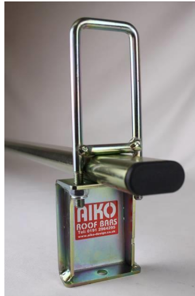
CS A bolt fixing